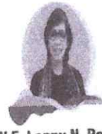
H.E. Lenny N. Rosalin Deputy Minister for Gender Equality, Ministry of Women's Empowerment and Child Protection in Indonesia Topic: "Promoting Gender Equality in STEM for Sustainable Development"