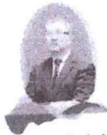
Hon. Fortunato T. de la Peña Secretary, DOST